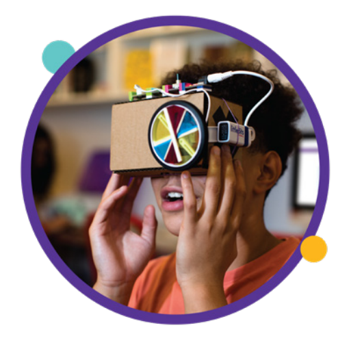
Exploring How littleBits Work

Are you wondering where to start with littleBits in your educational setting? The best way is to jump right in and learn by experimentation and play! The littleBits team has developed a a few mini-lessons designed to introduce you and your students to littleBits. Each lesson takes about one hour.